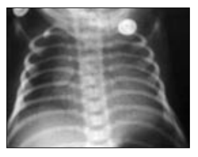
Figure 1 . Chest x-ray showing bilateral fine granular infiltrates.